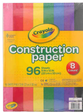
One Pack of Construction Paper