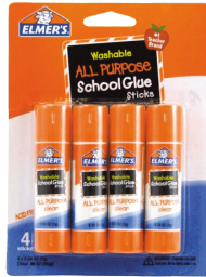
One Pack of Glue Sticks (4 Count)