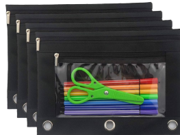
One Pencil Pouch