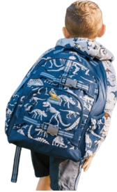
One Standard Size Backpack (Please No Small Backpacks)