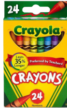
Two Boxes of Crayons (24 Count)