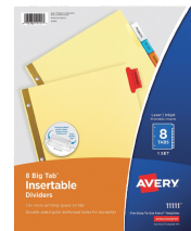
One Pack of Binder Dividers