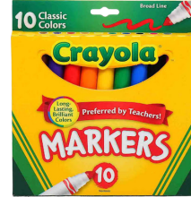
One Pack of Markers (10 Count)