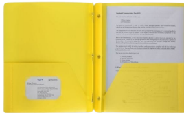
Two Solid Color Plastic Folders with Brads & Packets